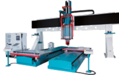
CNC machining centre for wood, plastics and compounds

WITTENSTEIN rack-and-pinion systems facilitate a modular design that allows the machine to be adapted to individual customer demands.