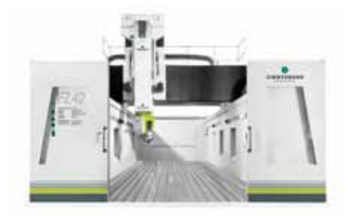
HSC (high-speed cutting) portal milling machine

Portal milling machines are used for machining large workpieces. Travel distances of 45 metres, portal weights of 20 tons and process forces of 50 kN when milling steel materials are typical specifications for these applications. Maximum precision and uniformity must be ensured in the drive train in order to achieve optimal workpiece accuracy and surface quality. The absolutely precise systems from WITTENSTEIN alpha are a great advantage here: two master-slave systems in a portal arrangement produce feeding forces of up to 180 kN, while the electronic tensioning in the master-slave setup provides accuracies of up to 5 µm.